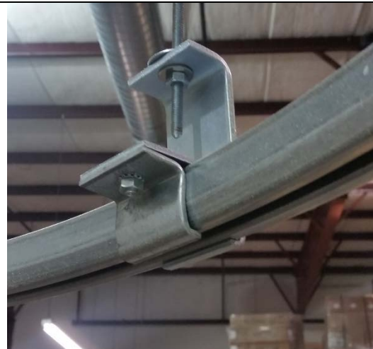
PWD344 – Support Bracket can be added anywhere along the length of the overall track.