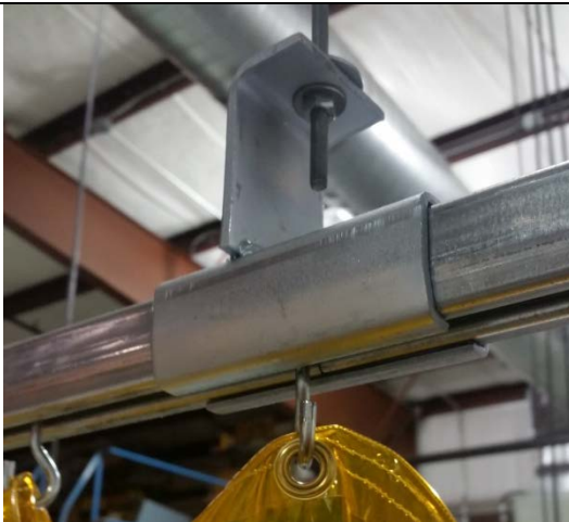
PWD343 – Joint Bracket is used to combine straight tracks together and also acts as a support bracket.