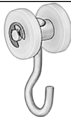
PWD345 – Roller Hanger(s) are used to attach the screen. You'll need one for every foot of material. Be sure to add an extra for the end of each screen.