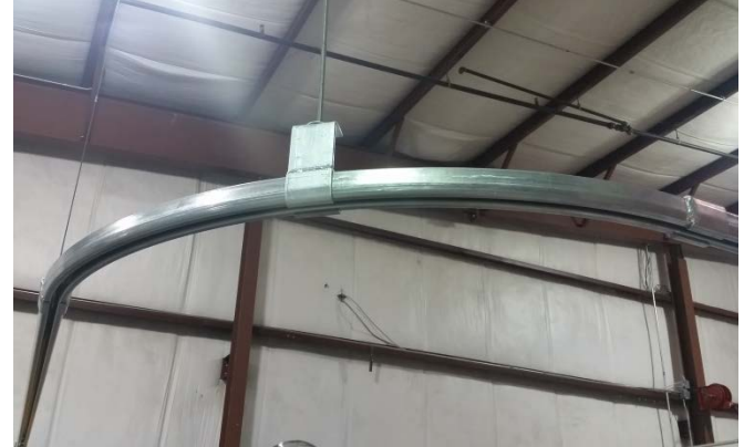
PWD342 – 90° Curve Track with a 2ft. radius and 3.1ft length. Do not need joint bracket.