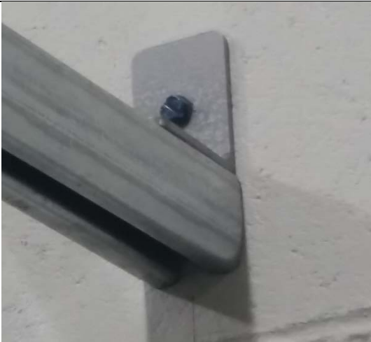
PWD347 – Wall Bracket are used to connect the track to the wall.