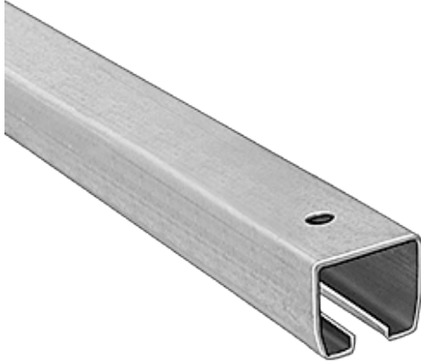
PWD341 – 8' Long Straight for the screen(s); rated for 100lbs.